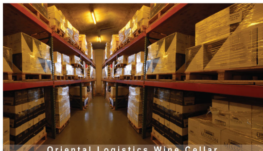
Oriental Logistics Wine Cellar

We employ and train experienced personnel to carry out the Pick and Pack operations according to specific requirements of our customers. At the same time, we utilize a host of value-added services such as: price label and security label tagging, barcode labeling and re-labeling, skillful garment re-bagging, repacking or garment hanging, and various quality control and inspection services.